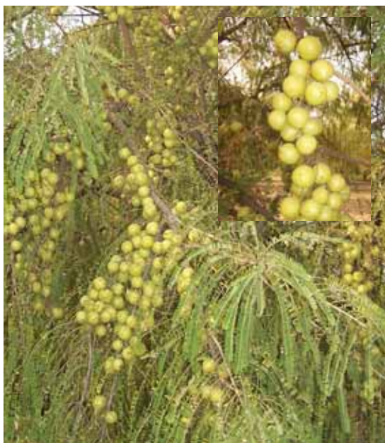
Fruiting on rejuvenated aonla tree

mainly done to modify the tree structure and maintain canopy size. Fruiting starts on third year after rejuvenation. Yield levels during initial year are slightly low, while the yield from third year onward is better than the unpruned trees.