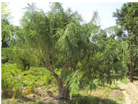
Development of better canopy as a result of shoot pruning

mainly done to modify the tree structure and maintain canopy size. Fruiting starts on third year after rejuvenation. Yield levels during initial year are slightly low, while the yield from third year onward is better than the unpruned trees.