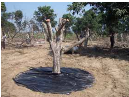
Headed back tree with black plastic film

redevelopment of canopy is necessary in older plantations, when the canopies are overcrowded resulted in reduction in yield. This is possible by hedging of branches followed by shoot management to modify the tree structure and maintain canopy size.