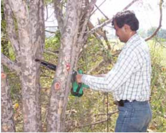
Heading back of branches